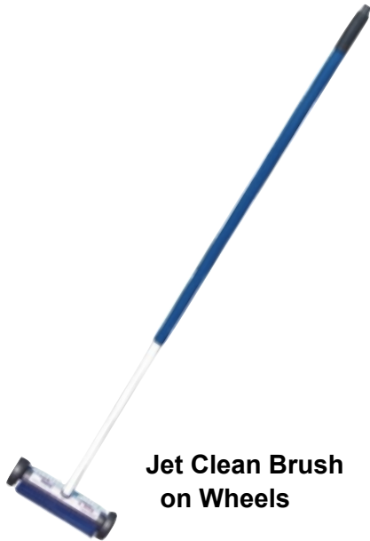
Jet Clean Brush on Wheels