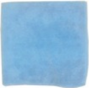
Blue Microfiber Cloth

Do Not rub spots & stains with a cloth, blot only.