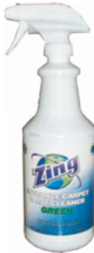
Entrance Carpet & Mat Cleaner Ready to Use