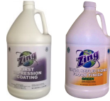
First Impressions Floor Coating Or Ultra Reflections Floor Finish