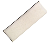
Microfiber Flat Mop Finish Applicator