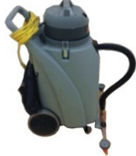
Wet & Dry Vac