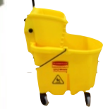
Mop & Bucket