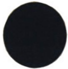
Black Strip Pad

M ix Zing Floor Prep 8 oz. per gallon with cold water .